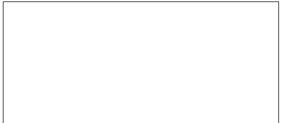
The Neenah Riverwalk~Shattuck Park project with the Library in the background.

For the complete text of all Mayor Scherck's responses, go to the City's website: www.ci.neenah.wi.us