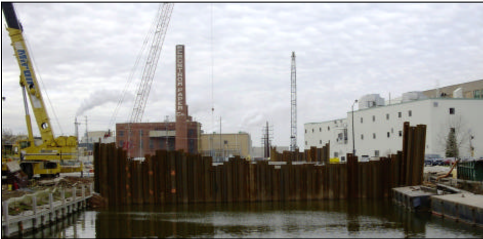
Cranes reach toward the sky behind the temporary dam on the Fox River Canal east of Commercial Street in downtown Neenah. The new Alta Resources office building and a city parking ramp will be located west of Commercial Street. The temporary dam holds back canal waters while construction work proceeds.