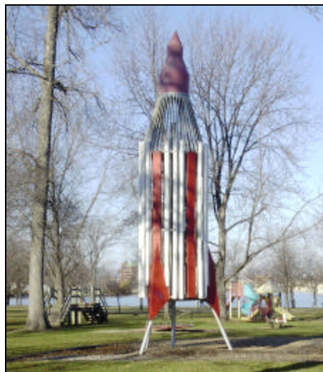
The Rocket Slide at Riverside Park (the slide has been removed for safety reasons).

If you are interested in preserving this memory, contact the Neenah Parks and Recreation office at 886-6062. We need individual and corporate donors but also someone to