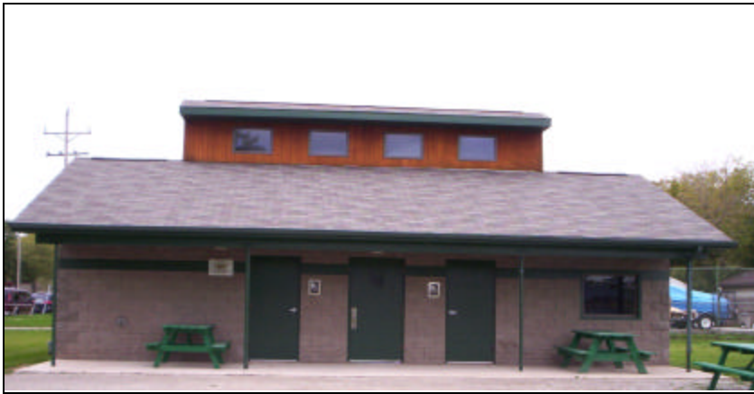
The Green Park Shelter, 337 Columbian Ave., accommodates a party of 40 with tables, chairs, heat, and restrooms. The park has picnic tables, open green space, tennis courts, and playground equipment. Available for daily rental Mon.-Thu./$25; Fri.-Sun./$40 (City of Neenah resident rates). For more information on this facility and others, call 886-6060.

For more information visit www.bgbrigade.com or telephone 920-725-3983. Thanks to the Brigade staff and dedicated volunteers for making Neenah a better place to live for all of us.