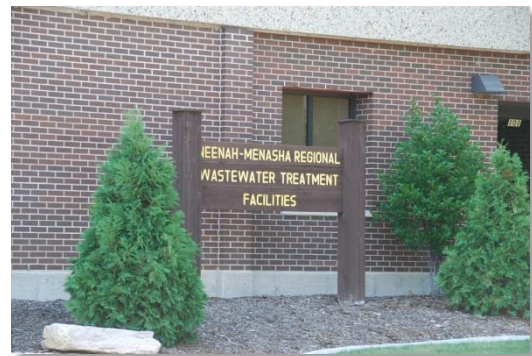
Neenah-Menasha Regional Wastewater Treatment Facility