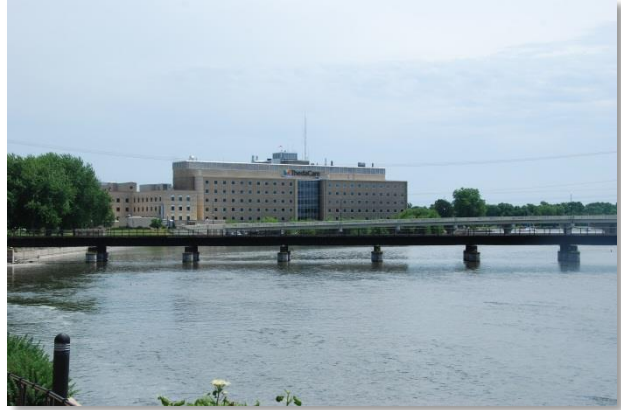
ThedaCare Regional Medical Center - Neenah