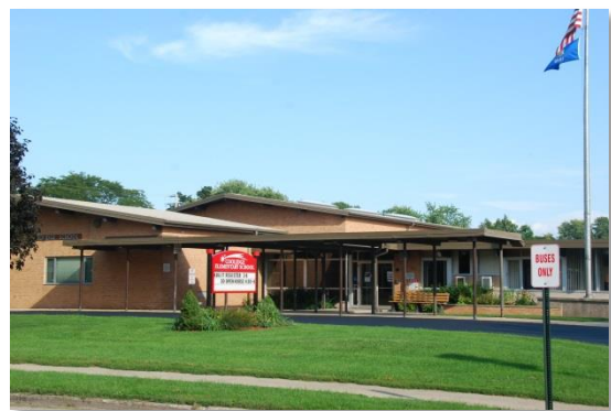
Coolidge Elementary School