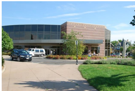
Neenah Public Library

The Neenah Public Library is seeing a slight decrease in circulation, and a number of new emerging trends. More people are attending free programs, classes, workshops, and utilizing free services at the library. The demand for public meeting space continues to increase. The children's department has seen significant growth in program attendance and participation. The library offers community outreach for all ages, and has expanded offerings to seniors in retirement communities.