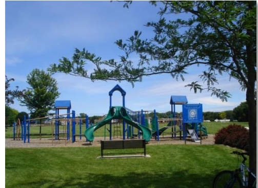
Great Northern Park