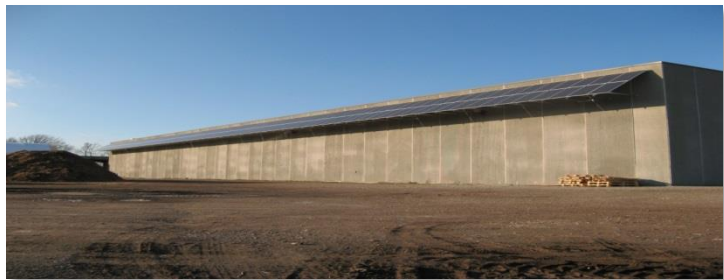
City Services Building

The majority of energy used in the City is from fossil fuels which is a non-renewable resource. The burning of fossil fuels releases greenhouse gasses which could impact climate change. Renewable energy on the other hand is considered a clean and sustainable resource. Unlike fossil fuels, it does not release greenhouse gas emissions or particulates. During public input suggestions were made in support of renewable energy such as geothermal, solar and wind. It is also the goal of the City of Neenah's Sustainability Plan to replace current electricity and transportation energy use with 25 percent renewable sources by 2025.