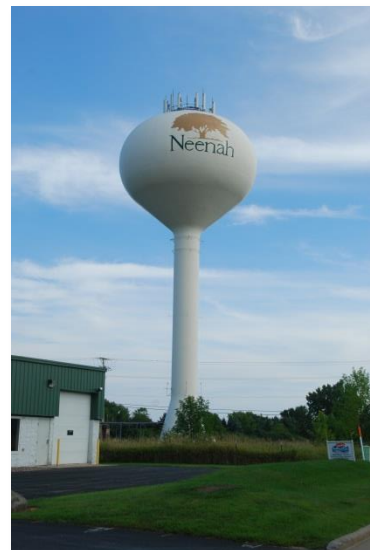
Neenah Water Tower