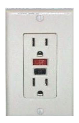
G.F.C.I. Ground Fault Circuit Interrupter