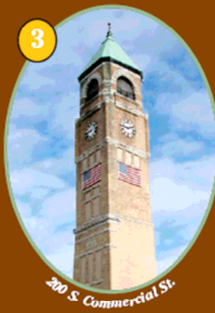
200 S. Commercial St.