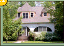
1102 E. Forest Ave.