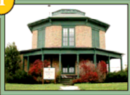
347 Smith St.