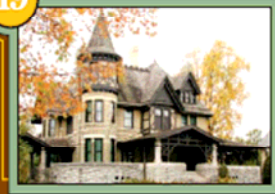
537 E. Wisconsin Ave.