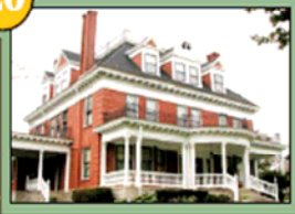
547 E. Wisconsin Ave.