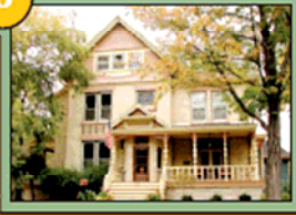
620 E. Forest Ave.