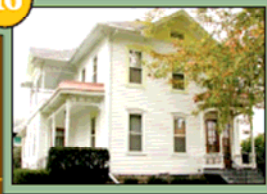
345 E. Wisconsin Ave.