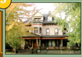
516 E. Forest Ave.