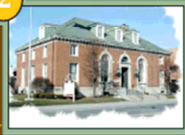
307 Commercial St.