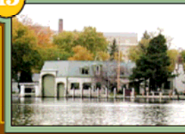
515 Clark St.