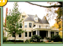
579 E. Wisconsin Ave.