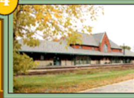
500 N. Commercial St.