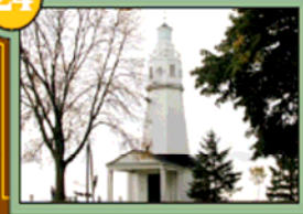
Kimberly Point Lighthouse