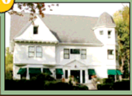
1010 E. Forest Ave.