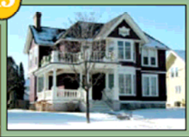
331 E. Wisconsin Ave.