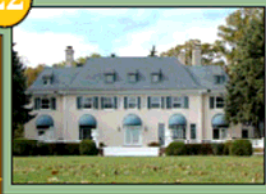
143 N. Park Ave.