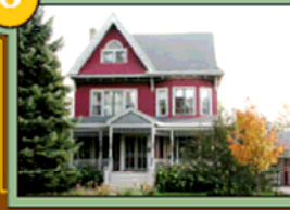
711 E. Forest Ave.