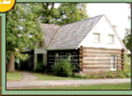
701 Lincoln St.