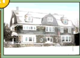
433 E. Wisconsin Ave.