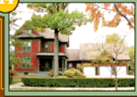
251 E. Doty Ave.