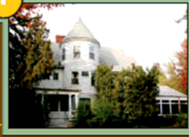
706 E. Forest Ave.