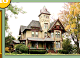
527 E. Wisconsin Ave.