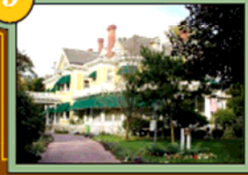
824 E. Forest Ave.