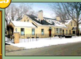
256 N. Park Ave.