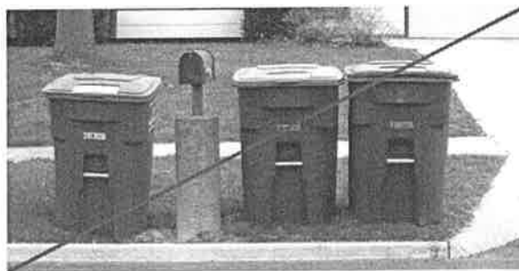
Carts are too close together and too close to the mailbox.

The Guide also contains information on recycling, yard waste collection, leaf collection, large item and metal collection and holiday collection schedules.