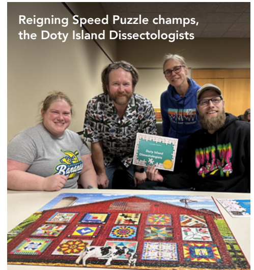
Reigning Speed Puzzle champs, the Doty Island Dissectologists

Teams are assigned a new, unopened 1000-piece puzzle. Teams have 150 minutes to complete the puzzle. The winner will be the first team to finish or, if no puzzles are completed, the team with the fewest puzzle pieces remaining. Prizes will be awarded to the first-place and second-place teams. All participants will be entered into a drawing for additional prizes.