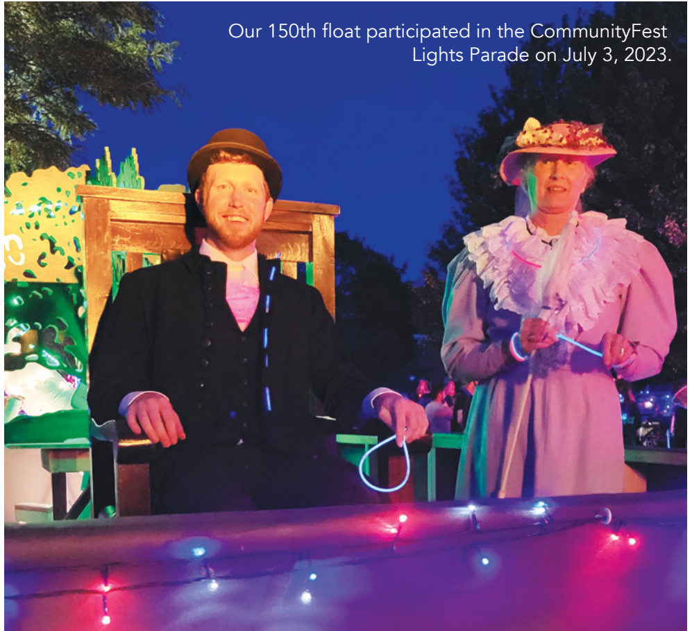
Our 150th float participated in the CommunityFest Lights Parade on July 3, 2023.

they made and the commitment they had to work for the betterment of the entire community. We hope you have enjoyed the opportunities to celebrate the 150th at the many celebrations that were held throughout the past season.