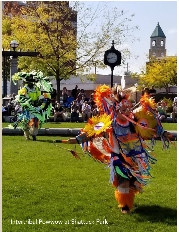
Intertribal Powwow at Shattuck Park

For more information, visit neenahhistoricalsociety.com