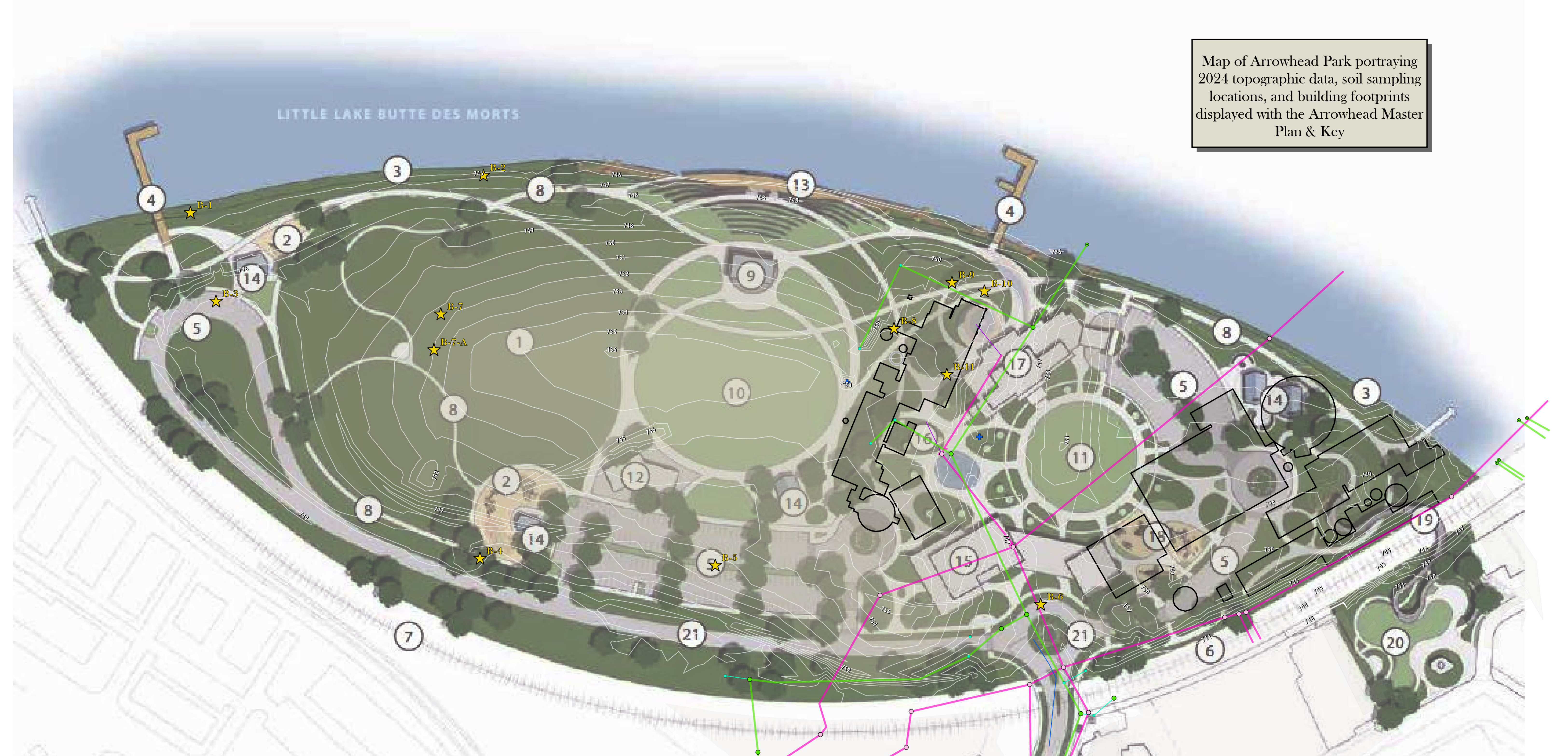
Map of Arrowhead Park portraying 2024 topographic data, soil sampling locations, and building footprints displayed with the Arrowhead Master Plan & Key