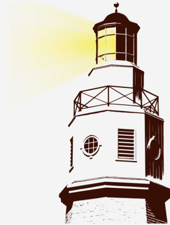
Kimberly Point Lighthouse

Those who still wish to donate can do so until May 1, 2026 to be included on the donor board, which will be affixed to the lighthouse and include all donor names.